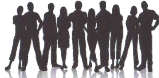
The Rich, Poor, Needy, Prudent, Witness, Wise, Counselor, Neighbor

(Clarity from the Book of Proverbs and How to Win)